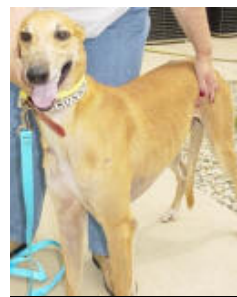
Matrix —4 year-old red fawn male