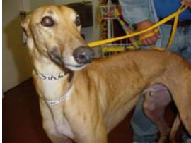
Fuzzy Dealer — 3 1/2 year-old fawn male