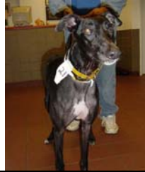
BB's Please —2 1/2 year-old Black Male