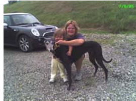
Dazzle — 7 year-old black female (senior)