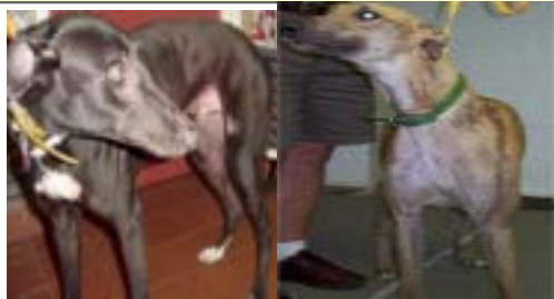
Warlock Claws—3- year old black male